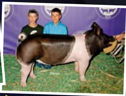
Reserve Middleweight XBred Barrow 7th Overall 2011

Check our website for more winners and pictures of our 18 County Fair Grand and Reserve Grand Champions in 2011!