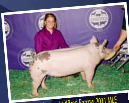
Reserve Lightweight XBred Barrow 2011 MLE